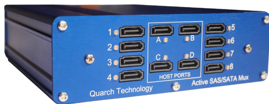
SATA Switch - Main Unit