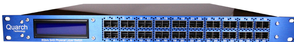
40 Port SAS Switch - Main Unit