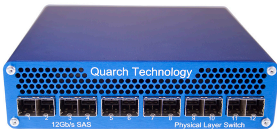
12 Port SAS Switch - Main Unit